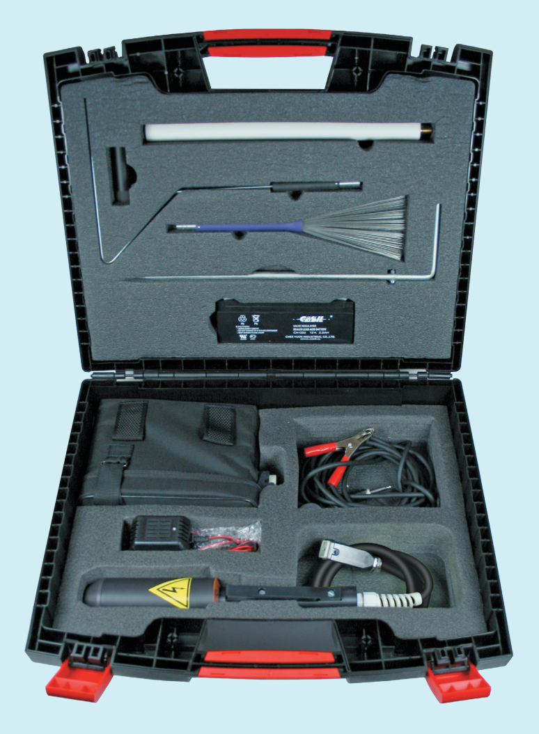
Basic delivery set of K-series Holiday Detector

Additional equipment depends on inspection application and is specified during order.